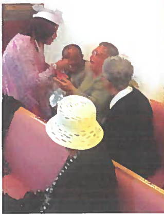
Altar Guild Photos from p.7